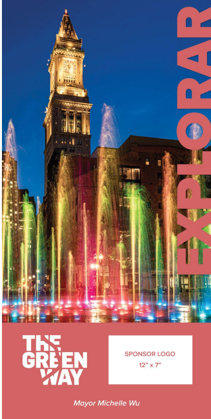
Sponsor Recognition: 12x7 inches