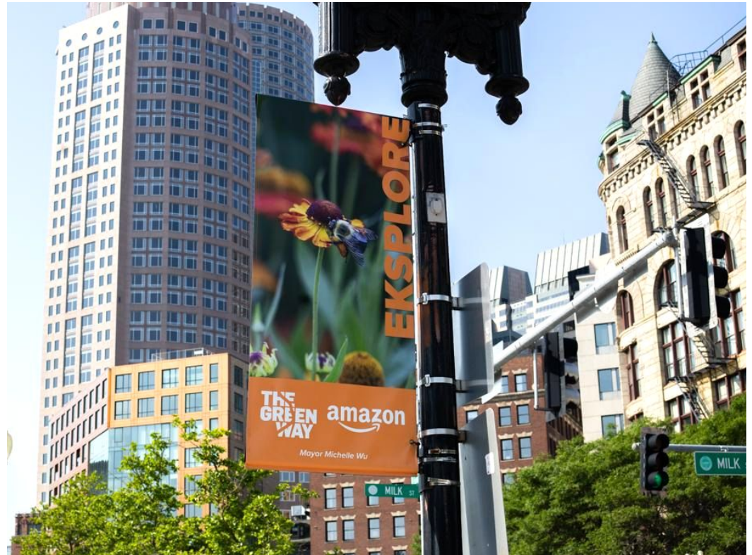
Banner design shown here is from 2025

The deadline to be included on banners is March 6, 2026.