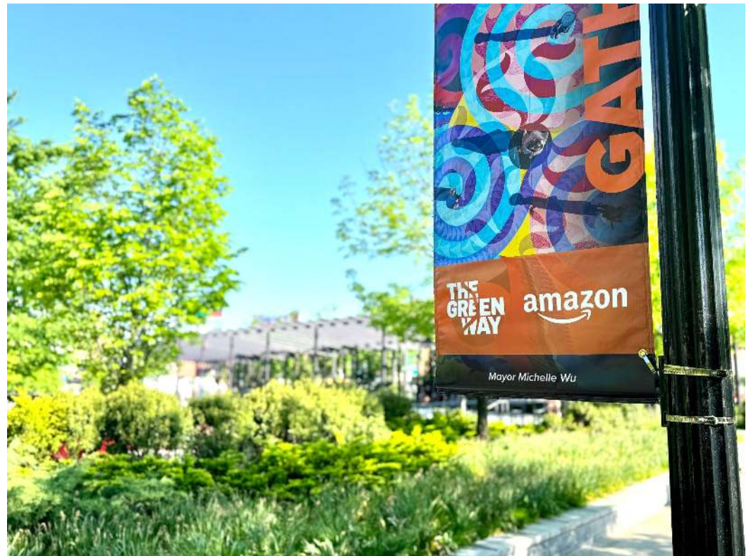
Banner design shown here is from 2024

The deadline to be included on banners is March 14, 2025.